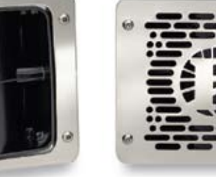
lush mount with grille, SMFT-EF